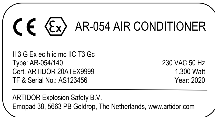
Example of a window air conditioning unit label

Labels are attached to the air conditioning AR-054 for marking purposes. The specific marking label depends on the applicable model of the air conditioning system and will be created according to the unit assessment certificate. All necessary warnings are marked.